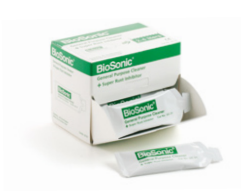
General Purpose Cleaner + Super Rust Inhibitor