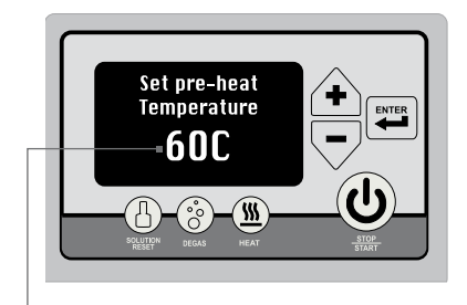
Solution heating Preheat your solution to desired temperature