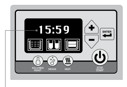
• Countdown Timer Know exactly when your instruments will be ready for the autoclave