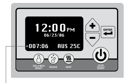
-- Solution Tracking See exactly how long your solution has been in use